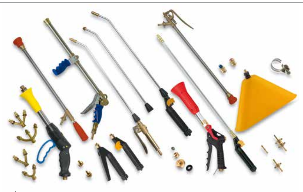
ACCESSORIES AND SPARE PARTS FOR PRODUCTS IN THE VARIOUS LINES.