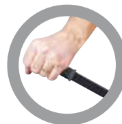
METAL CONTROL LEVER