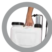
PRACTICAL HANDLE FOR TRANSPORT