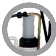
Ø 52 PLASTIC PUMP WITH HYDRAULIC AGITATOR LARGE WATER RESERVOIR