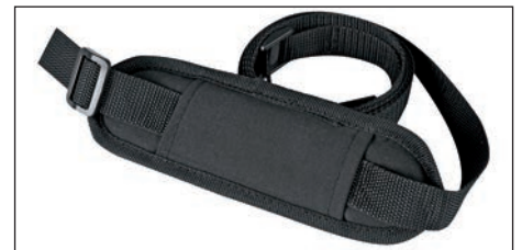
Wide and long carrying strap with comfortable and adjustable shoulder pad