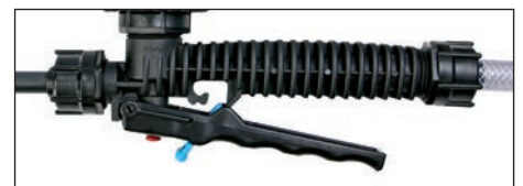
Special trigger valve with VITON® seals and stainless steel spring